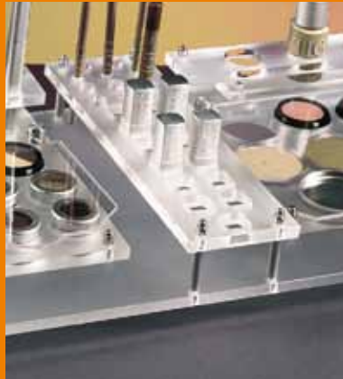
Plexiglass display made of satins, into which cosmetic articles can be placed