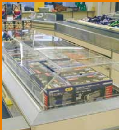
Alarm-secured product container with electronic unlock device, for reducing theft rates