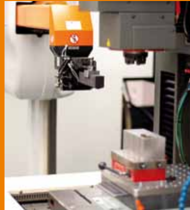
Artificial materials and plastics processing