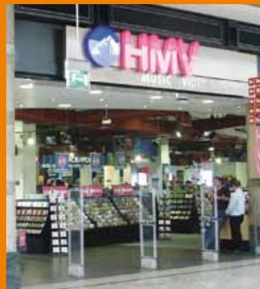
Product theft control at the storefront door