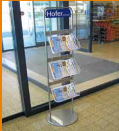
Stand display made of stainless steel, with suspended acrylic pouches