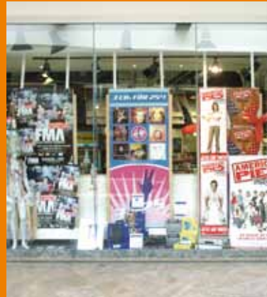
Set-up of shop windows with large digital prints