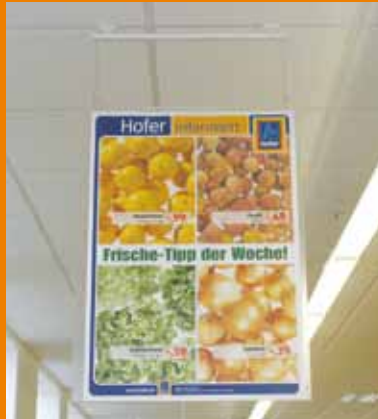
Patented, magnetic suspended system for hanging your advertisements, without a ladder or external tools being required