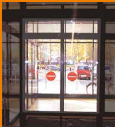
Laser-based security device, for controlling customer traffic flows in and out of the store