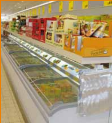
Shelf construction over refrigerated compartments, used to expand the overall sales surface