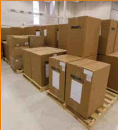
Logistics and shipment